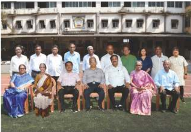
CES existing committee