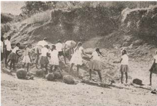
Turning the hill into an amphitheatre