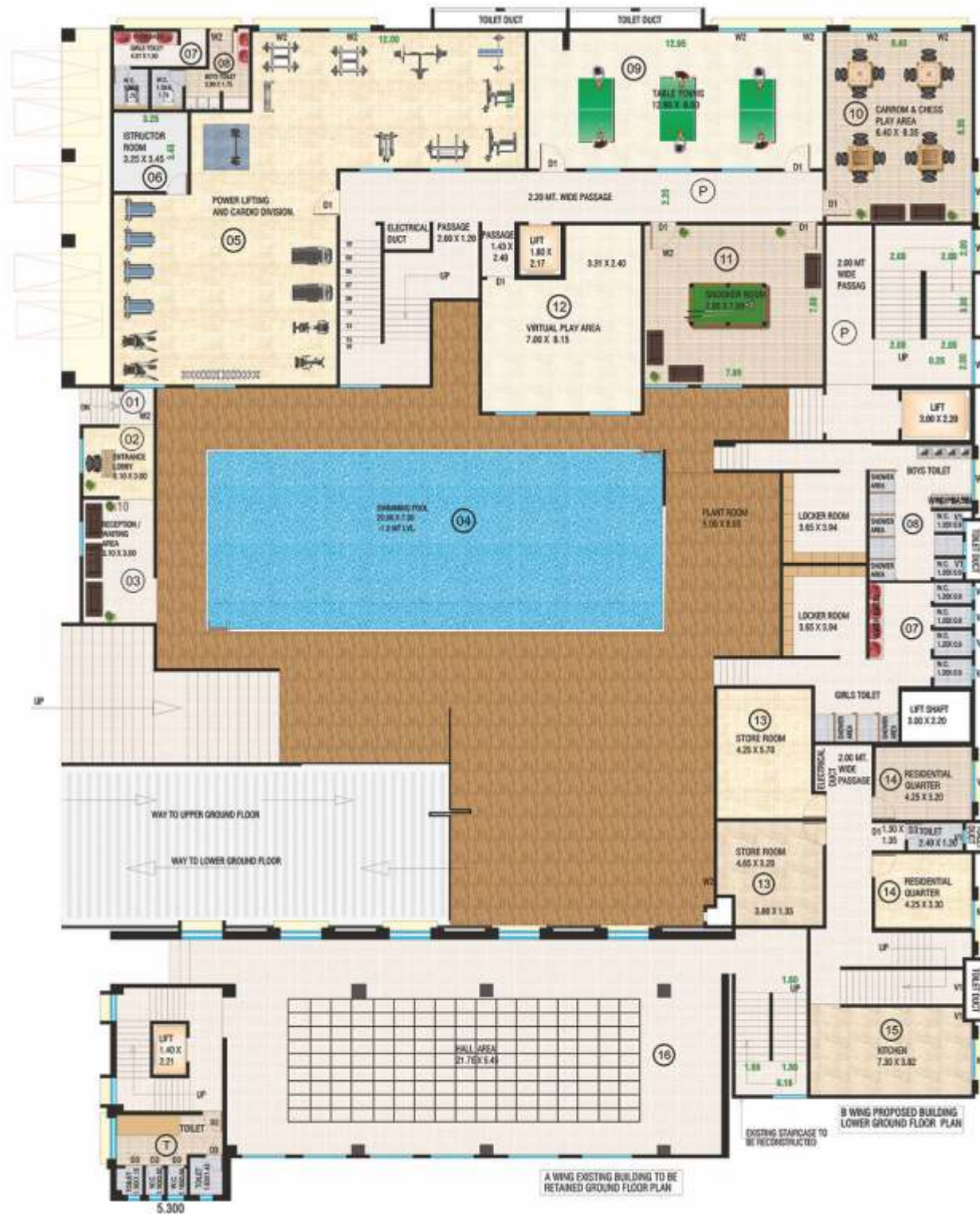
Plan : Lower Ground