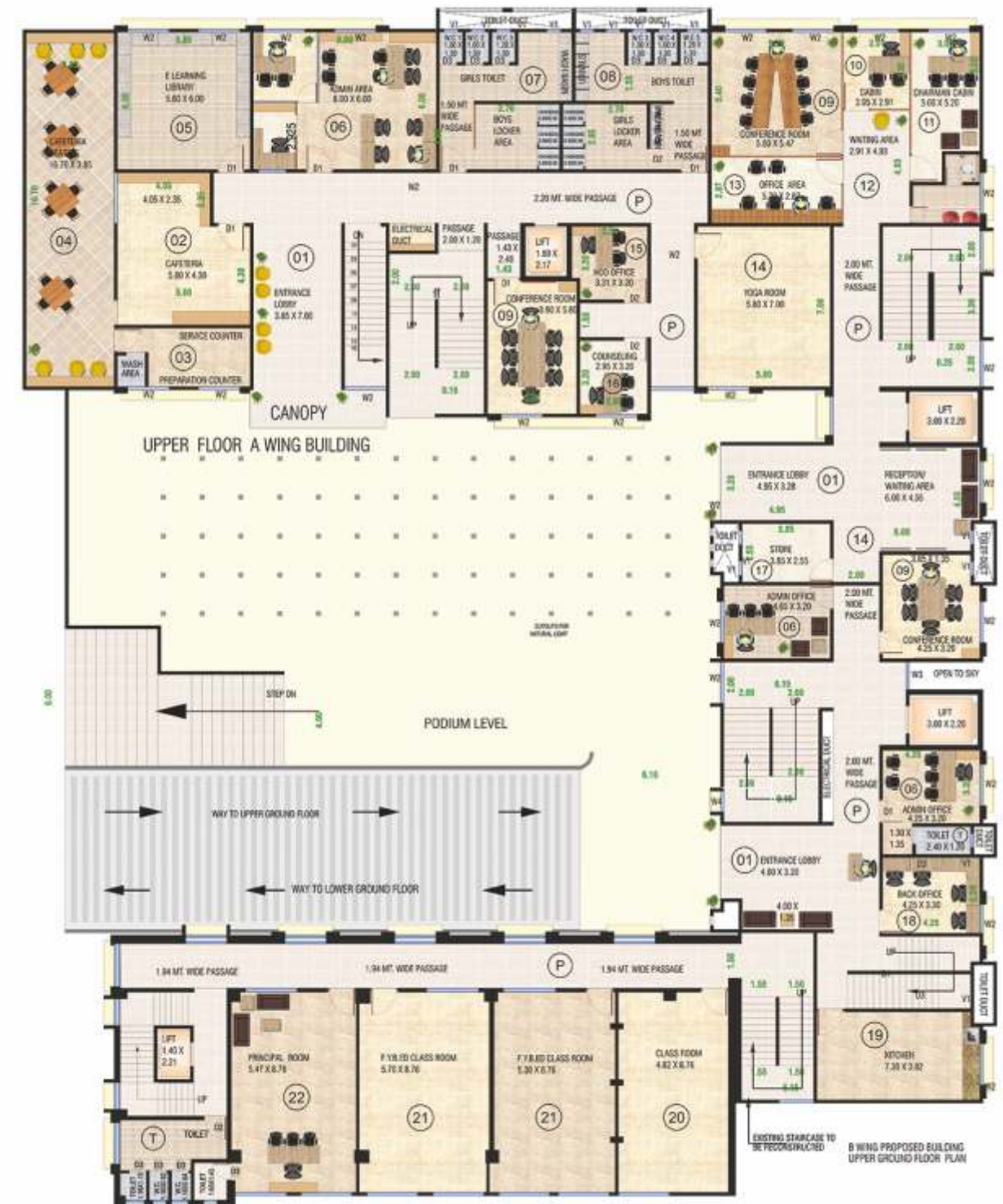
Plan : Upper Ground